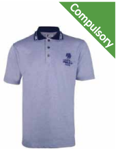
Senior Polo YR12 ONLY $36.40