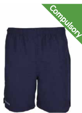
Unisex Sports Shorts $34.30