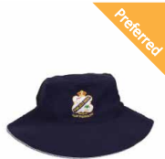
Bucket Hat $19.70