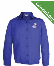
Music Blouse* $46.80