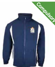
Track Jacket $62.30