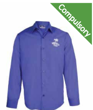
Music Shirt* $46.80