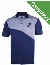
Junior Unisex Polo $36.40