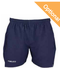
Girls Sports Shorts $34.30